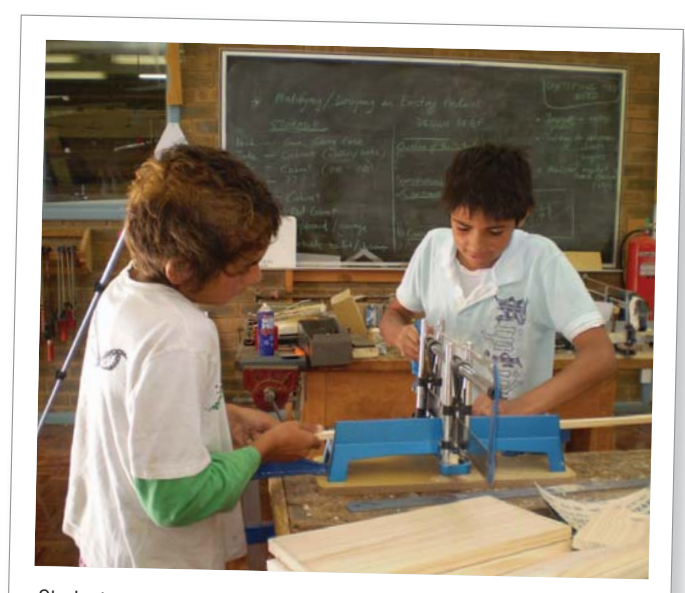
Students practise their woodwork skills during a visit to Bairnsdale Secondary College

This is because, as an intensely social environment, the school's social atmosphere can significantly affect students' senses of competence and broader attitudes. Students who enjoy strong connections to their teachers and peers via social activities feel a greater sense of purpose and pride about their participation and have more positive long term outcomes.