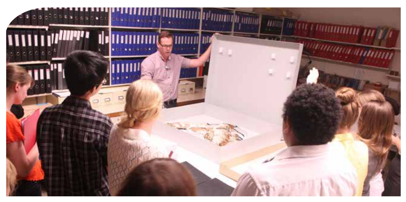
Above: Queensland Museum Work Inspiration Program

Students also worked in small groups to develop their ideas for new museum experiences, which was a good opportunity to develop friendships with peers from different schools. They presented their ideas to senior managers at the end of the three days, explaining their idea, who it was targeted to and why the Museum should do it. It was their opportunity to contribute to something at the heart of the organisation and it was the Museum's chance to hear directly from young people about what would appeal to them.