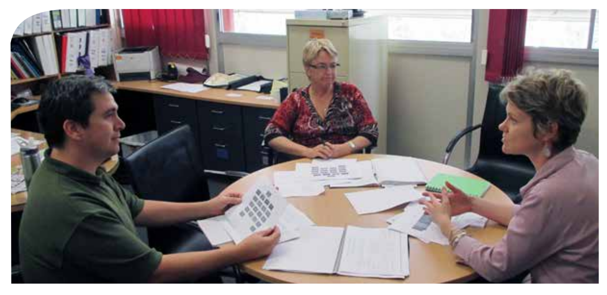
Above: Partnership Brokers with the Principle and Head of Industrial Arts at Sandgate District State High School planning for the Partnership Action Committee