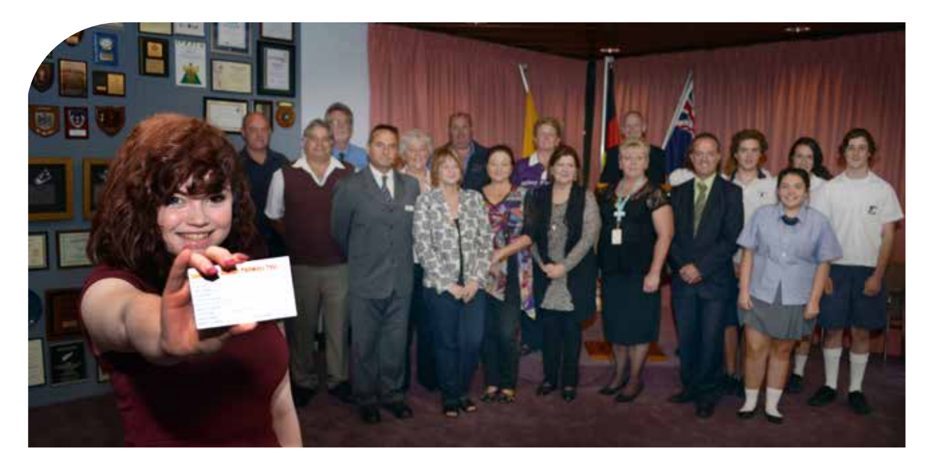
Above: Shoalhaven Student Pathways Pass Launch.

There were no contractual obligations from Transport NSW on any bus company to agree to the Shoalhaven Student Pathways Pass. It took attendance at a number of meetings of the relevant decision-making body - the Shoalhaven Transport Group - over approximately 18 months, to persuade the bus companies and Transport for NSW to agree to a solution. Central to this was developing a proposal which made use of services which were mostly under-utilised and was therefore cost neutral. Strategies included conducting a survey of 32 local educational and youth organisations to document the transport problems affecting young people (this evidence gave the partnership the initial invitation to the Shoalhaven Transport Group), and arranging for a Year 11 work placement student to present to a meeting of the bus companies. Her presentation made the problem real as she graphically