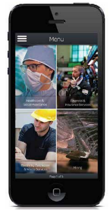
Above: The Career Hunter App.

It is a really great idea to bring together such key statistical information about industries of employment into one tightly focused reference and link it with information about training pathways.