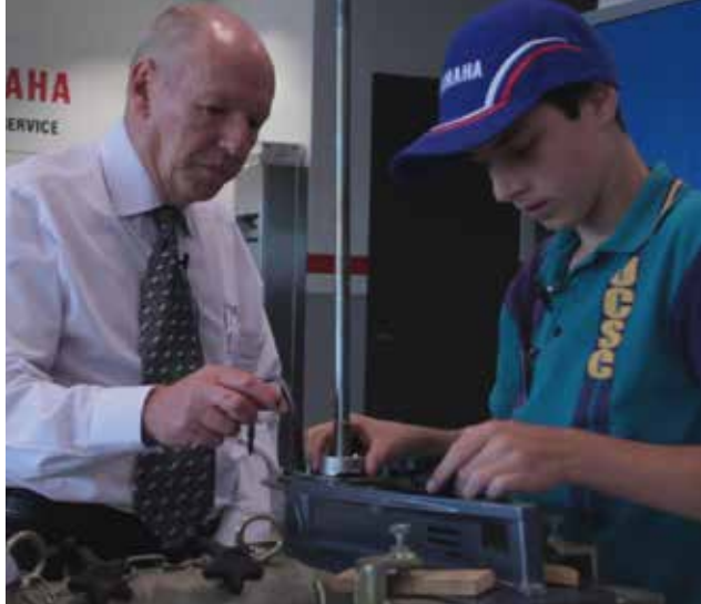
Above: Yamaha Student Grand Prix Work Inspiration Program

to participate in future years so it can help address the industry-wide skill shortage. The benefits of being a major employer with high brand recognition meant other employers were willing to join the partnership. At school too, everyone acknowledged Yamaha as a big player , says a Year 9 teacher.