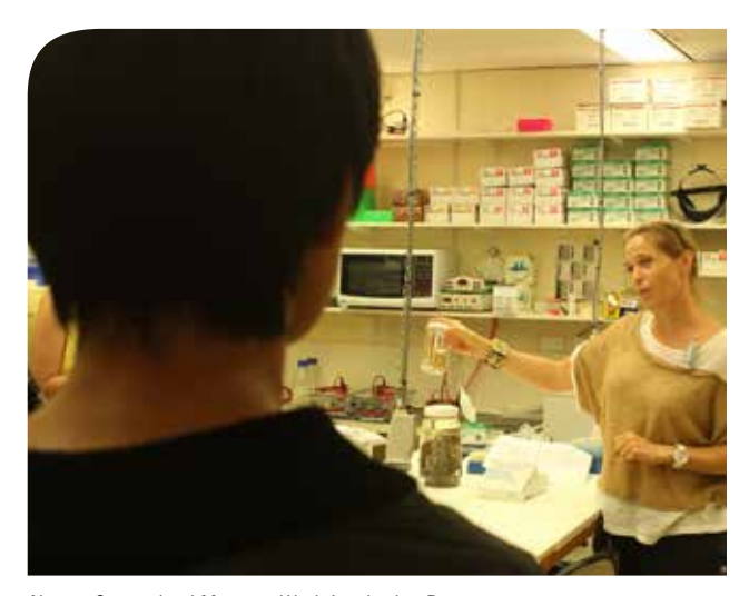
Above: Queensland Museum Work Inspiration Program

The Partnership Broker saw it was a good fit for a Work Inspiration pilot and suggested the Museum offer a learning experience for students at the same time as obtaining their ideas about how to encourage more young people to come to the Museum. The key for Work Inspiration and many other youth attainment and