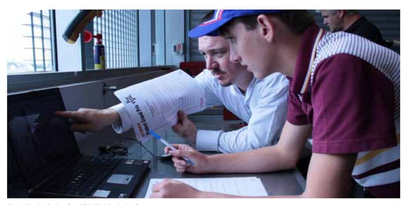
Above: Yamaha Student Grand Prix Work Inspiration Program

The partnership also offers a competition for students - the Yamaha Student Grand Prix. The Queensland Yamaha Student Grand Prix partnership creates opportunities for students in Year 9 to have a first-hand experience of the marine and motorcycle mechanics industries. Engagement at this stage of high school is seen as ensuring students get a chance to make senior subject selections and stay engaged with education. This has been developed by the partnership, modified