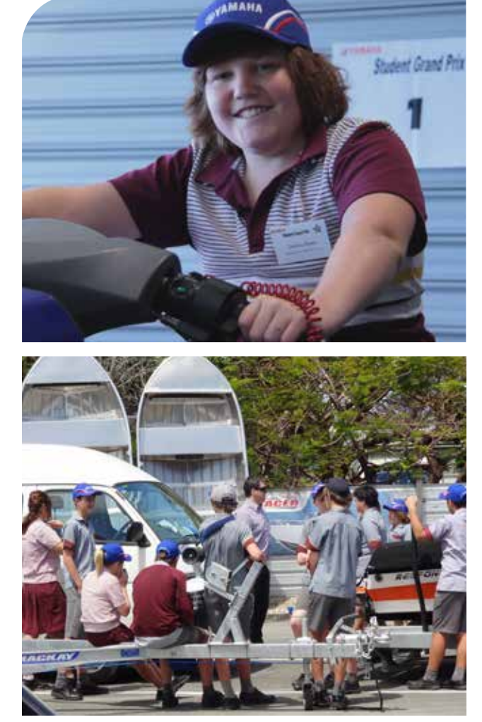
Above: Yamaha Student Grand Prix Work Inspiration Program

With strong endorsement from the local businesses who had participated in the partnership, Sandgate High School was successful in their application for a Trade Training Centre.