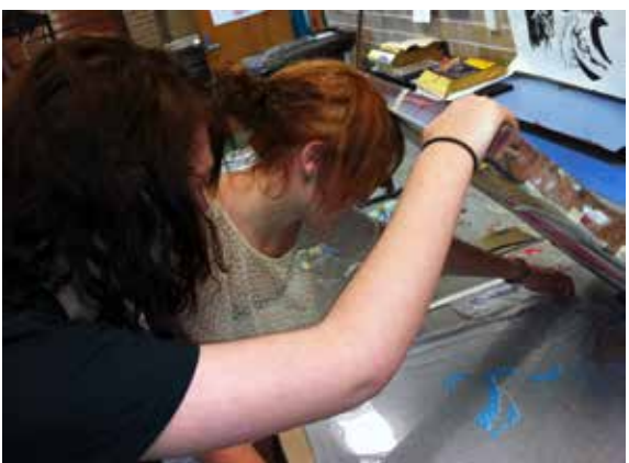
Above: ANZ Young Entrepreneurs program.

with two Partnership Broker sites in Sydney where ANZ was keen to replicate the program. The Bankstown and Penrith-Richmond program which commenced in 2012 has assisted 35 young people working in five teams.