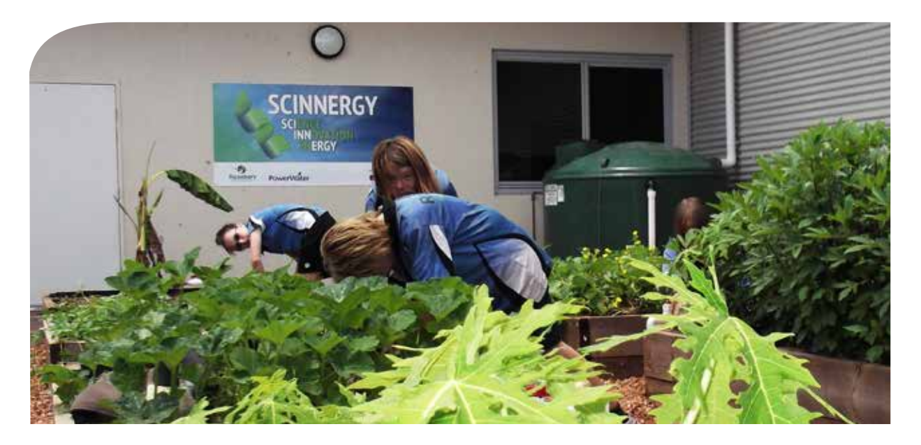
Above: Power and Water Corporation Partnership.

return home to their remote communities. Already the adjustments to the science curriculum have been shared between the schools.