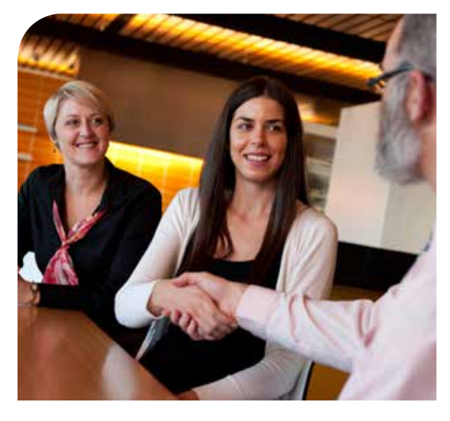
Above: Partnership Brokers.

The Educating Remote Area Indigenous Children in an Urban Setting (ERICUS) program was developed and largely driven by the school itself from 2008-09 but in October 2010 they sought assistance from The