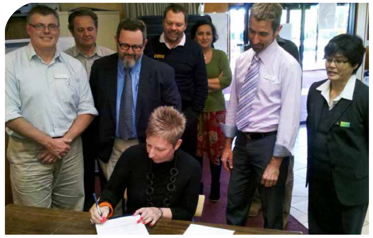
Above: A collaboration table in Toowoomba to support refugee and migrant students.

In recognition of the need to lift Australia's Year 12 or equivalent completion rates, the Council of Australian Governments (COAG) agreed to a National Partnership on Youth Attainment and Transitions in July 2009. The Partnership seeks to improve young Australians' educational outcomes and transition to