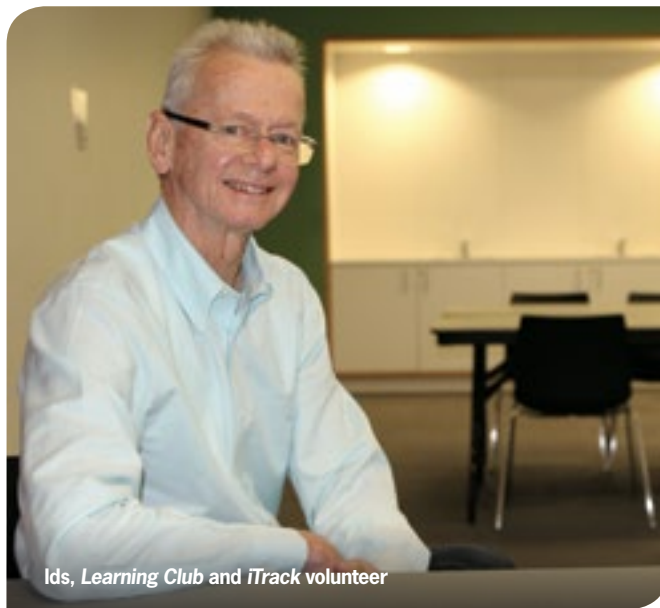
Ids, Learning Club and iTrack volunteer

A. It's a program for older students who are starting to think about what they might like to do in life after school. Some have an idea of what they want to do, others don't. As a mentor,