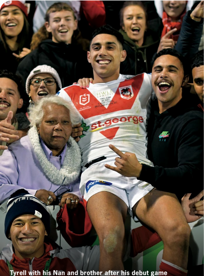
for the St George Illawarra Dragons