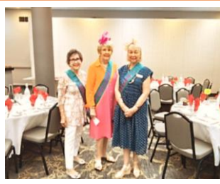
Beautiful hats & fascinators.