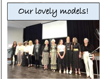
Our lovely models!