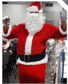
Santa handed out the gifts!!.....