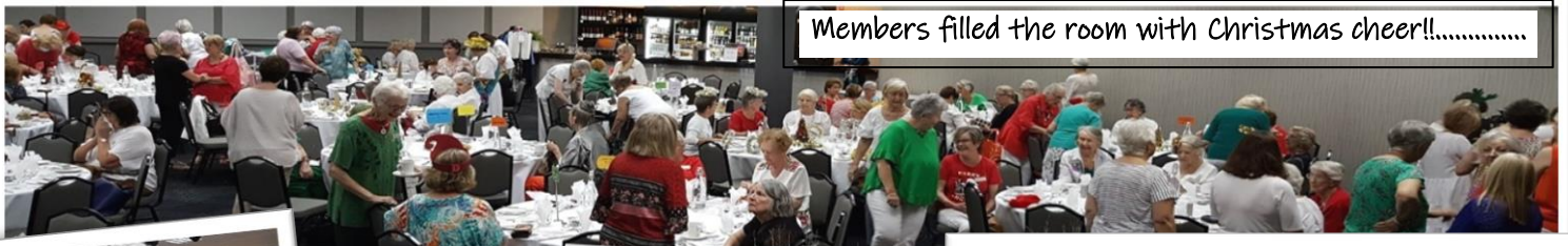
Members filled the room with Christmas cheer!!.....