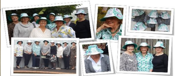
And our HAT design won the 'Most Innovative Accessory' in the Tea Towel Photo Competition.