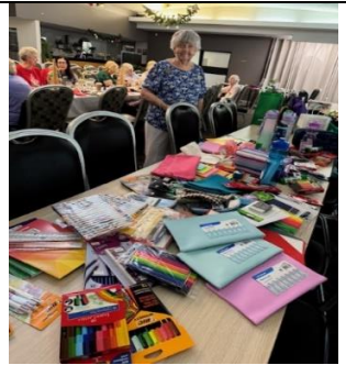
Lots of stationery for LfL students