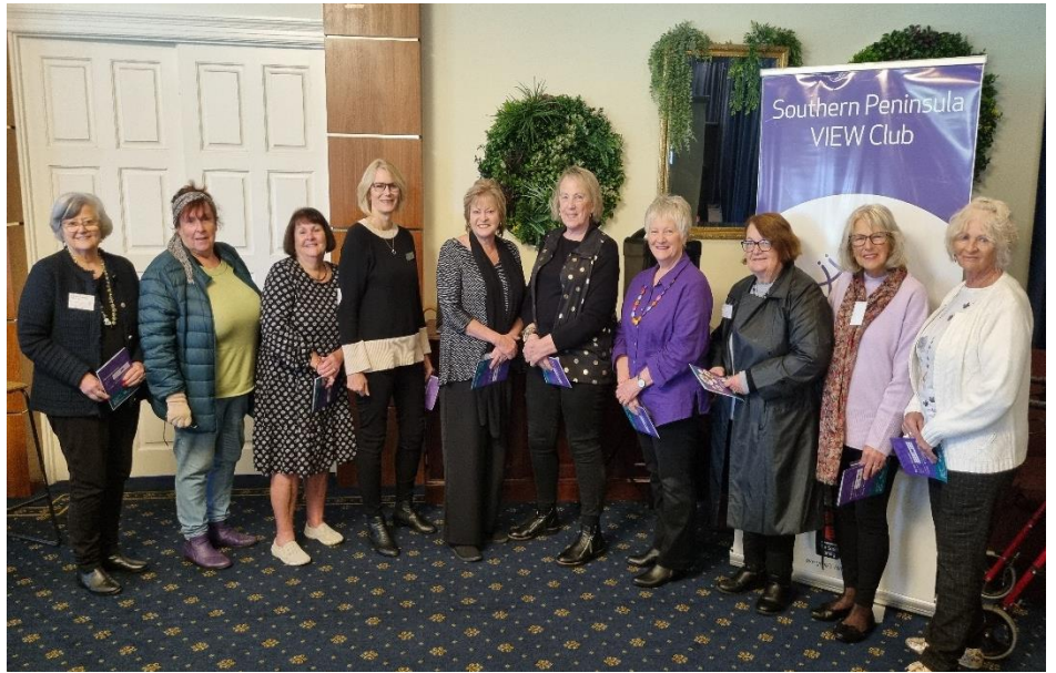
Badge presentation to ten lovely new club members: →