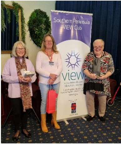
↑ Door Prize Winners: