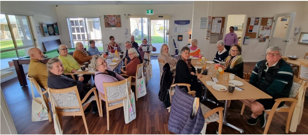
Taking in a tour and presentation at AVEO Safety Beach as a fundraiser.

Our Creative Arts and Wellbeing Group is off and running at Seawinds Hub. Some of our members enjoying their projects.