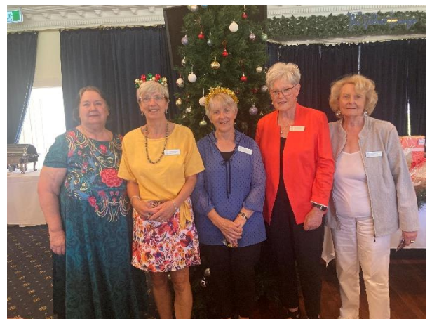
→ Birthday Girls: December