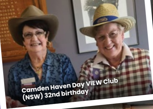
Camden Haven Day VIEW Club (NSW) 32nd birthday

A selection of photos from recent VIEW activities