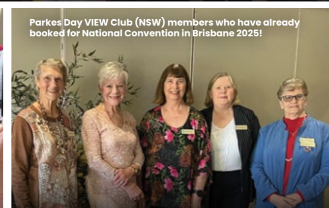
Parkes Day VIEW Club (NSW) members who have already booked for National Convention in Brisbane 2025!