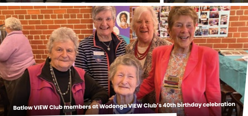
Batlow VIEW Club members at Wodonga VIEW Club's 40th birthday celebration