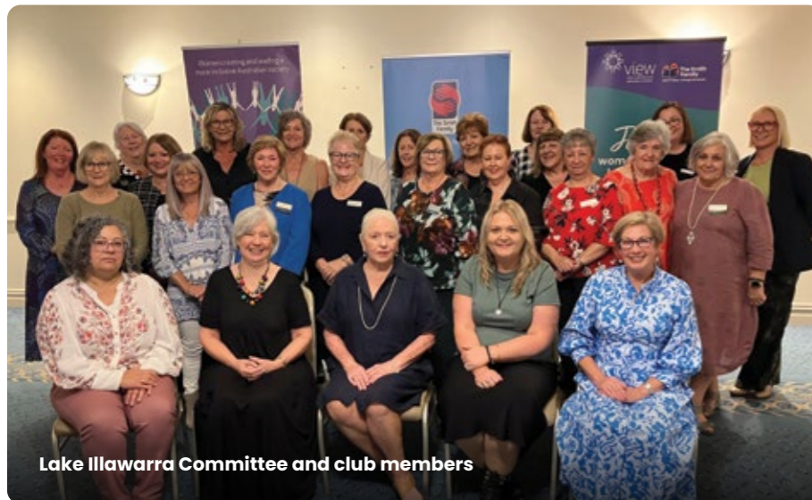
Lake Illawarra Committee and club members

Nothing beats a personal invitation to VIEW! Do you have friends in any of the areas where VIEW is establishing clubs or where a club already exists? Tell them about VIEW and why you love being a member.