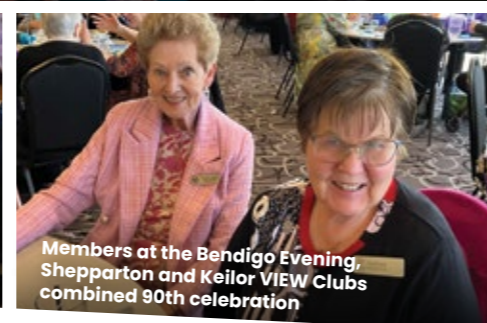
Members at the Bendigo Evening, Shepparton and Keilor VIEW Clubs combined 90th celebration