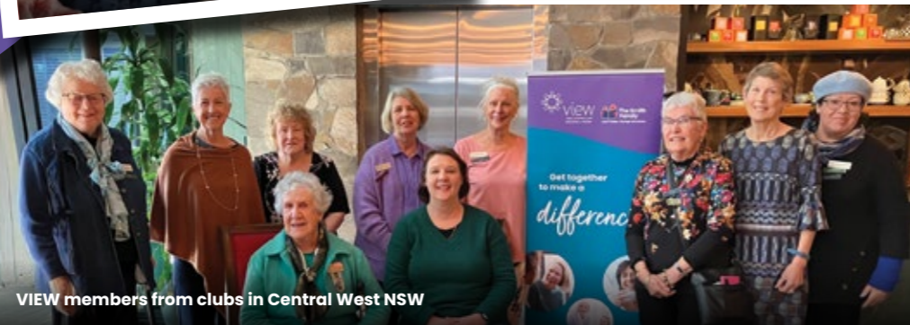
VIEW members from clubs in Central West NSW