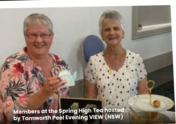
Members at the Spring High Tea hosted by Tamworth Peel Evening VIEW (NSW)