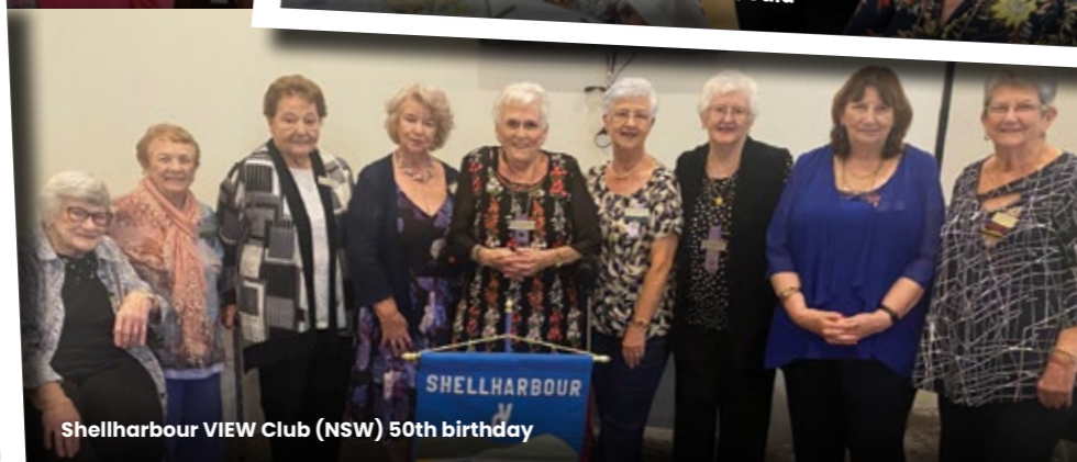
Shellharbour VIEW Club (NSW) 50th birthday