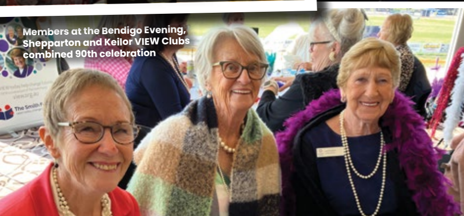
Members at the Bendigo Evening, Shepparton and Keilor VIEW Clubs combined 90th celebration