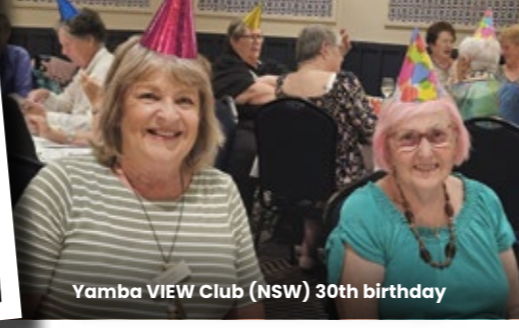
Yamba VIEW Club (NSW) 30th birthday