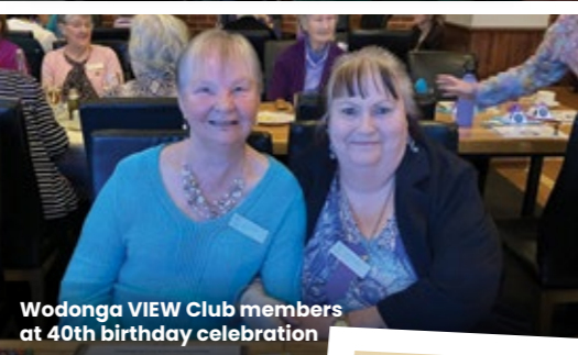
Wodonga VIEW Club members at 40th birthday celebration