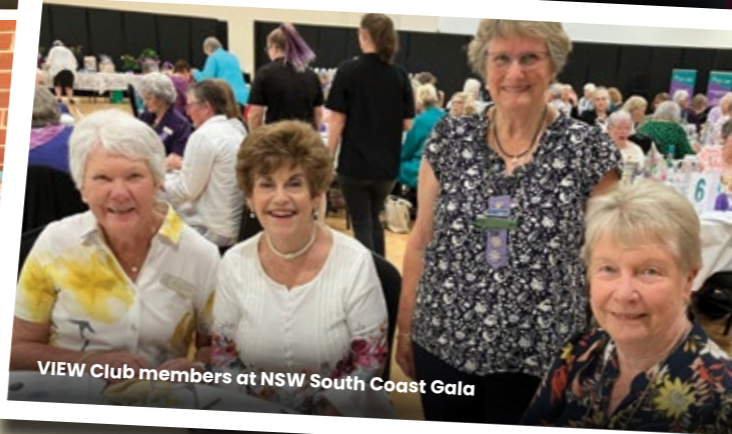
VIEW Club members at NSW South Coast Gala