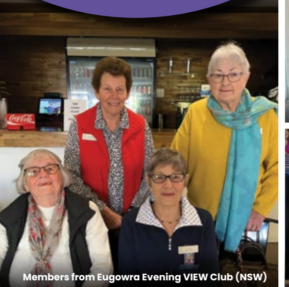
Members from Eugowra Evening VIEW Club (NSW)